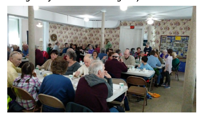
4th graders, grandparents and seniors at luncheon

About 93 people attended our luncheon on the 7th. This included the 4th graders and their teachers from WES, the students' grandparents and COA members. We were honored to have our Hampshire Regional School District superintendent also attend. After our luncheon, the members of the class entertained us with a variety of talents. Their performances are always amazing! The final performance this year was a 'synchronized swimming' skit by all the boys. (Luckily, no real water was in the skit, but they did a great job of entertaining us!)