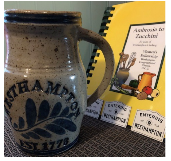
"Westhampton 1778" stoneware pitcher, magnets and coveted Church cookbook, "Ambrosia to Zucchini"