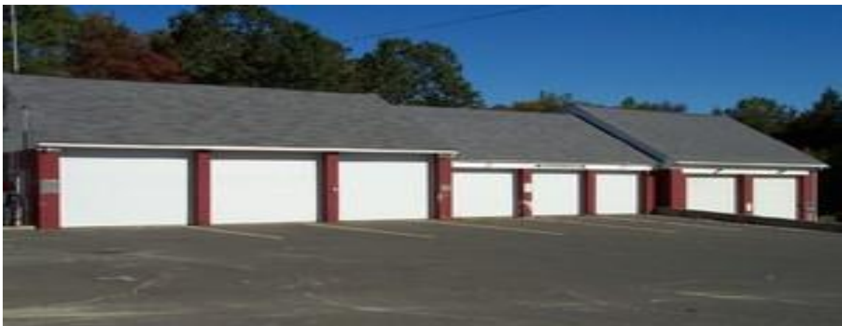
Westhampton Public Safety Complex

There are a number of capital projects that the Fire Department is going to need input and support on from the community in the immediate future. The largest of these is a need for a new Public Safety Complex to meet the growing demands of the community. The current facility is reaching seventy years old and no longer is able to accommodate the demands placed on the public safety services (Police, Fire, EMS, and Emergency Management). In addition, one of the Engines is thirty years old and has reached its life expectancy. However, no new Engine available will fit in the current facility given the current size and parameters.