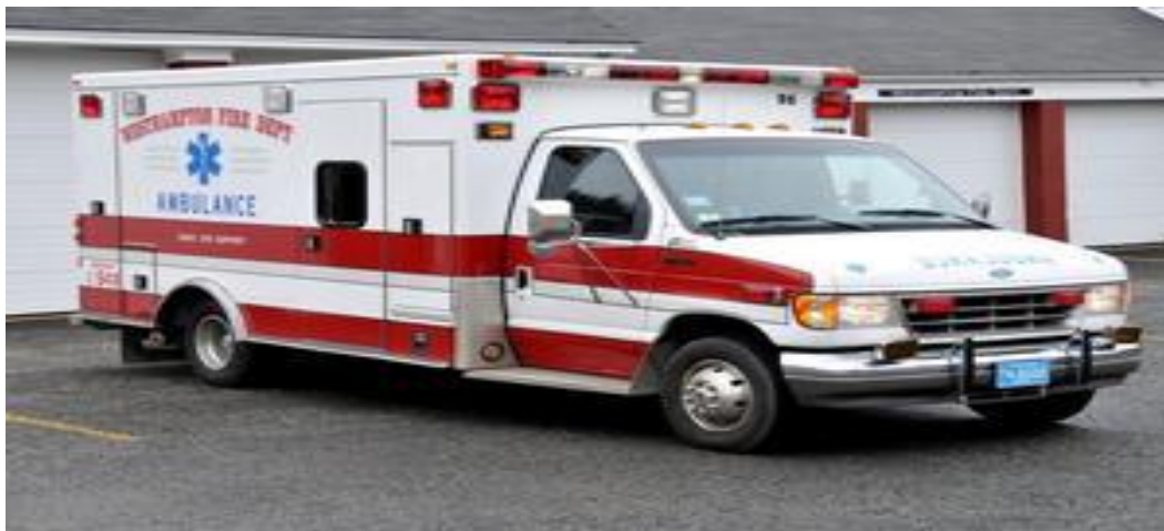
1996 Westhampton Ambulance

The Department had all of the fire hose pressure tested to ensure adequate operational effectiveness. National Standards recommend that this is done once a year, and in addition, it is reflected in the ISO ratings that this testing procedure be done to minimize the insurance rates in Town. More important, to ensure the safety of all members utilizing fire hose during operational procedures, it is our responsibility that they are provided with equipment that is safe and functioning to the highest standards. The testing revealed that the Department did have fire hose in service that did not pass the required pressure rating. These were removed from service and replaced with some of the spare hose that was also tested and passed the requirements. These testing requirements demonstrated that this was a project that was needed and should be continued each year to help ensure that the integrity and operational capacity of the equipment is maintained. We also had all of our ground ladders tested to the National Standards, ensuring they could meet the performance requirements during emergency operations. All of these projects are critical to properly maintaining all of the equipment and ensuring the highest degree of safety for our personnel utilizing these resources.