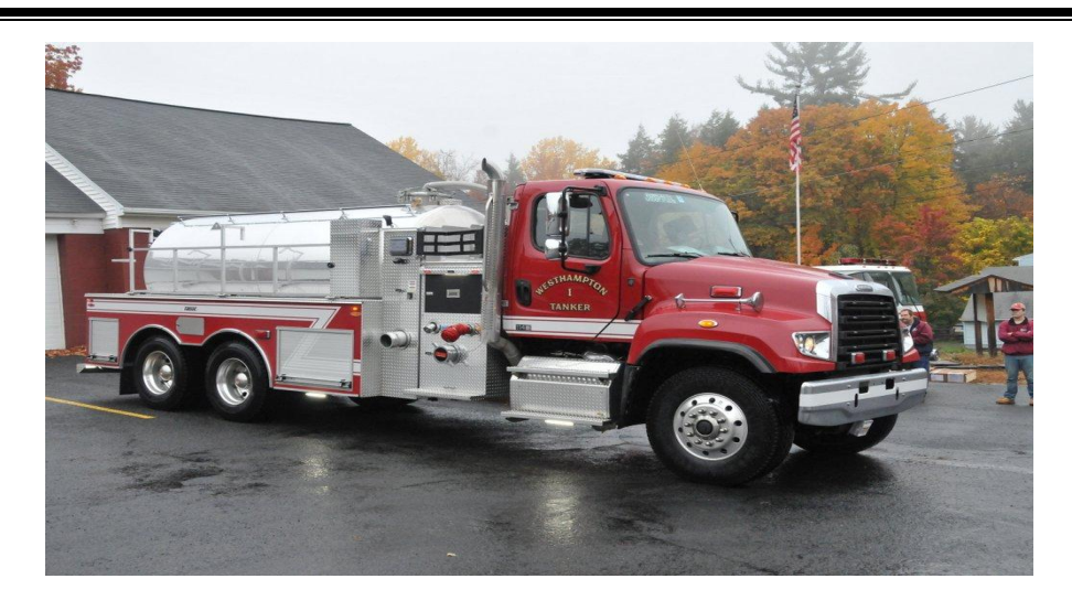
2017 Tanker Truck

The new Tanker Truck was put into service on November 20, 2016. This vehicle was obtained with the assistance of a $226,000 federal grant last year as well as funding from the Town in the amount of $85,000. This vehicle is critical for our operations as the town has no municipal water supply or hydrants and relies solely on a mobile water system for fire suppression. This vehicle provides much more versatility and pumping capabilities that the older vehicle never had. Most importantly, this vehicle is much safer and more reliable and is designed for emergency vehicle response.