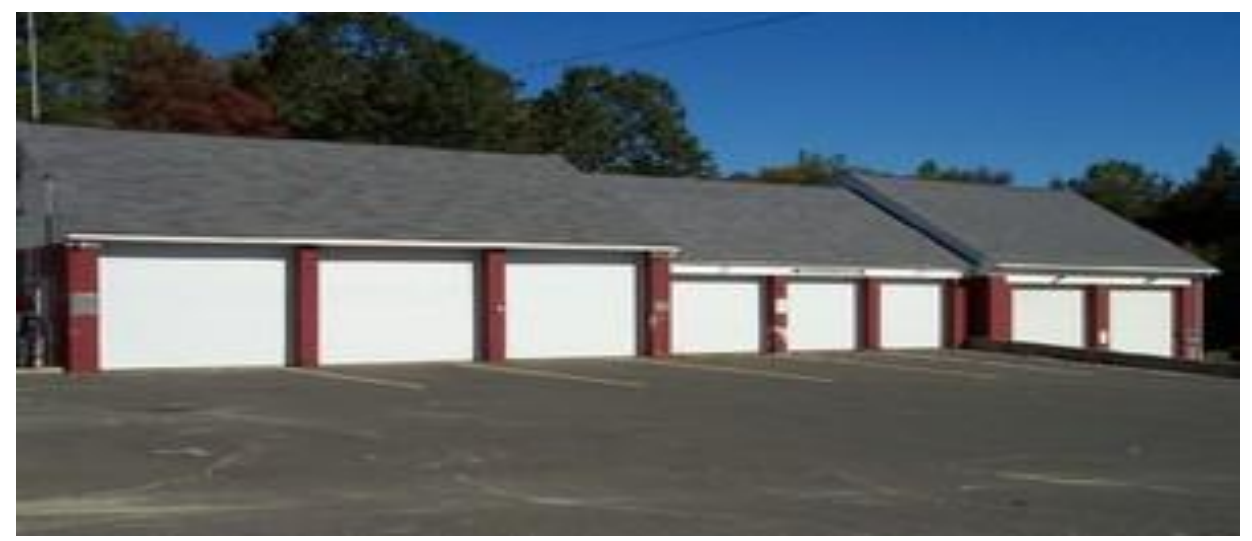
Westhampton Public Safety Complex

There are a number of capital projects that the Fire Department is going to need input and support on from the community in the immediate future. The largest of these is a need for a new Public Safety Complex to meet the growing demands of the community. The current facility is reaching seventy years old and no longer is able to accommodate the demands placed on the public safety services (Police, Fire, EMS, and Emergency Management). In addition, one of the Engines is thirty years old and has reached its life expectancy. However, no new Engine available will fit in the current facility given the current size and parameters.